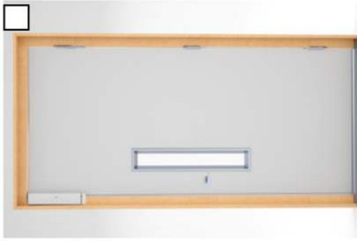
Flat Vision Panel