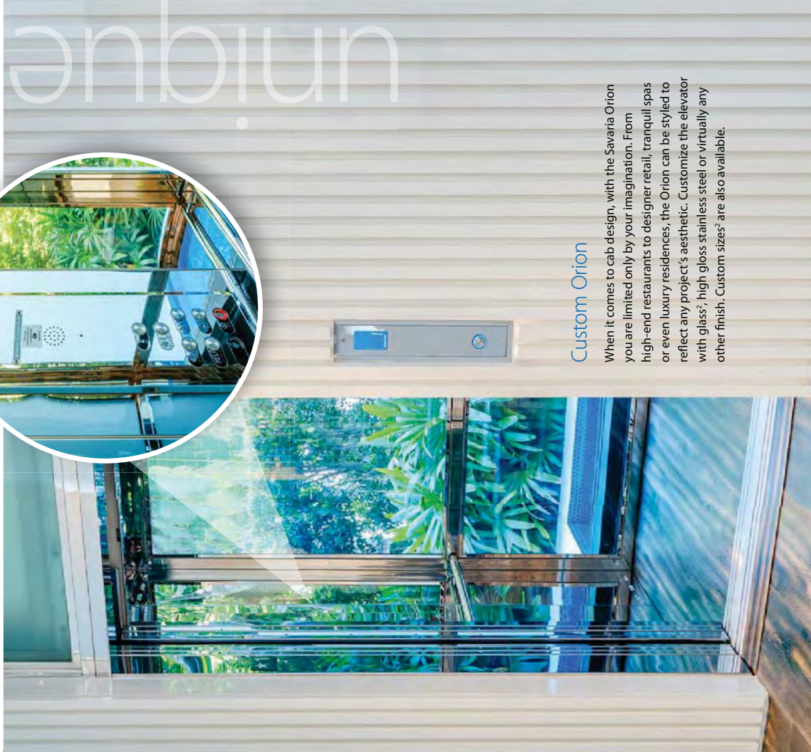
High gloss stainless steel wall and COP