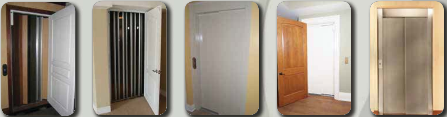
Solid Vinyl Accordion Gate